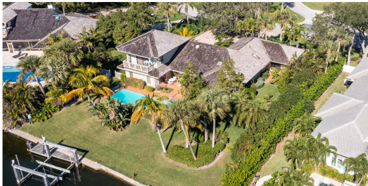
201 SPINNAKER DRIVE