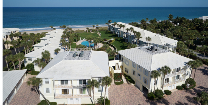
THE BILLOWS #A19