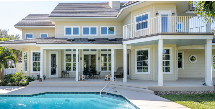
2218 E. OCEAN OAKS