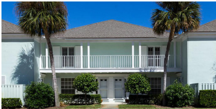
PORPOISE BAY VILLA #401D