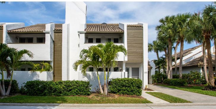
2198 VIA FUENTES