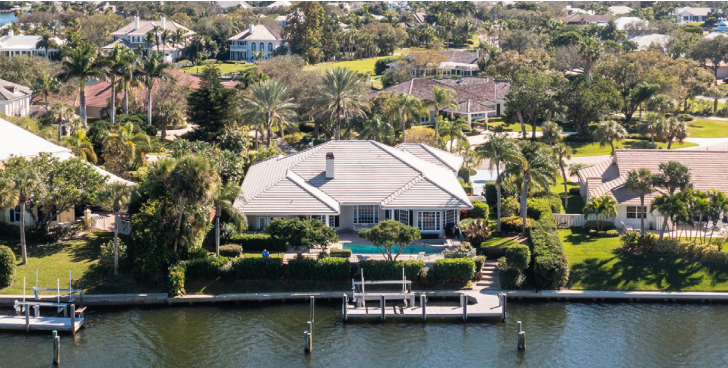
206 SPINNAKER DRIVE

PRESORTED STANDARD MAIL U.S. POSTAGE PAID Ironside Press