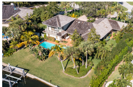
SOLD IN THE ANCHOR 201 SPINNAKER DR. | LIST $1,950,000