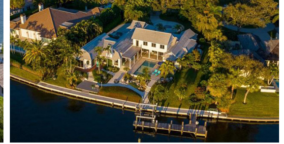
SOLD IN THE ANCHOR 122 SPINNAKER DR. | LIST $3,400,000