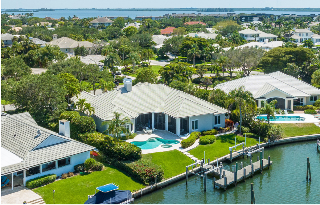
LISTED & SOLD IN THE ANCHOR 226 BINNACLE PT. | LIST $3,195,000