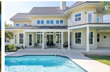
SOLD IN OCEAN OAKS EAST 2218 E. OCEAN OAKS. | LIST $1,750,000