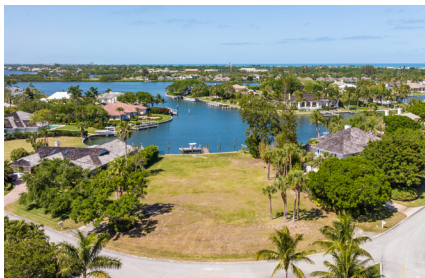
LISTED & SOLD IN THE ANCHOR 213 SPINNAKER DR. | LIST $1,750,000