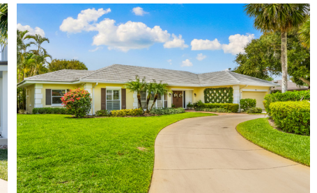
LISTED & SOLD IN THE MOORINGS 975 LANTERN LN. | LIST $1,575,000

Put the Moorings Realty Sales Co. team to work for you.