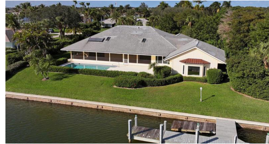
SOLD IN THE MOORINGS 1915 CUTLASS COVE | LIST $2,500,000