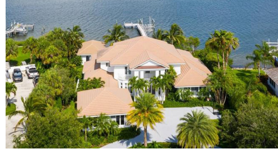
SOLD IN SEAGROVE WEST 275 RIVERWAY DR. | LIST $8,900,000