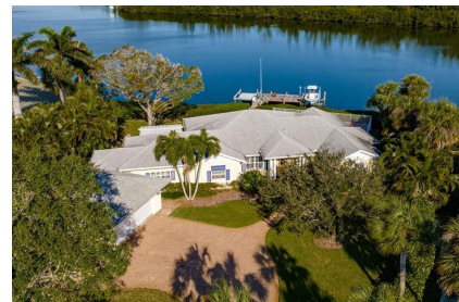
SOLD IN CACHE CAY 41 CACHE CAY | LIST $2,250,000