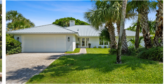
SOLD IN THE MOORINGS 970 BEACON LN. | LIST $2,275,000